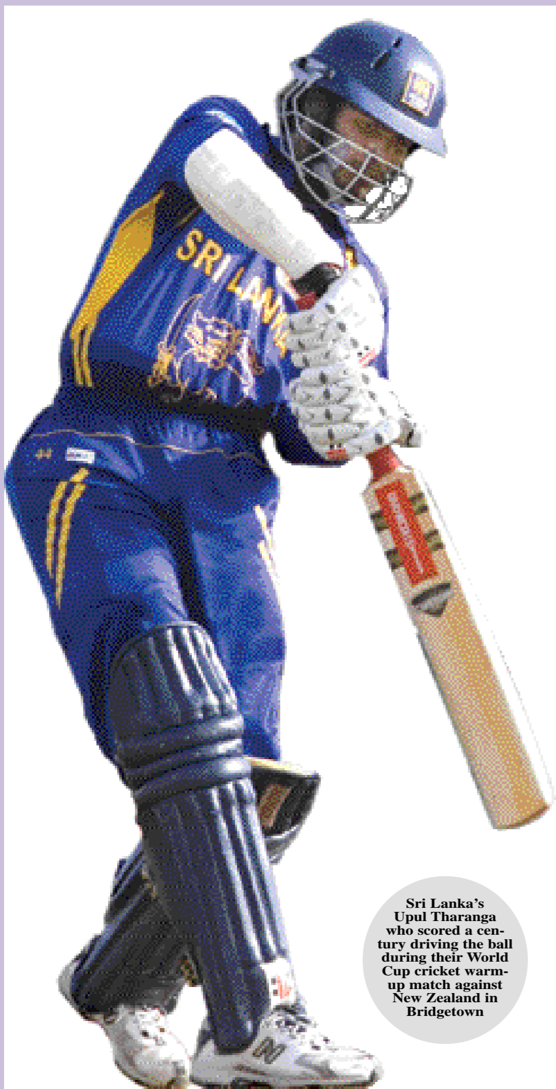
Sri Lanka's Upul Tharanga who scored a century driving the ball during their World Cup cricket warm-up match against New Zealand in Bridgetown