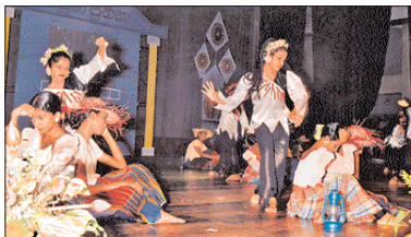
A modern dance