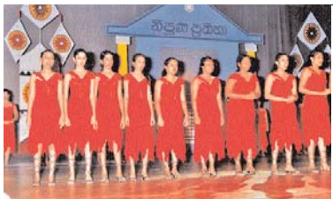
The choir of Sujatha Vidyalaya