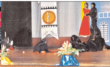
An act of a drama