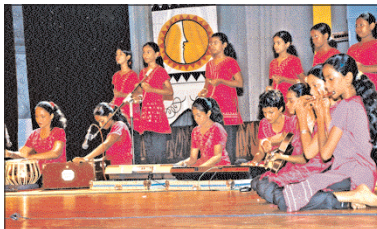
The Eastern Band