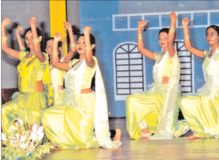
Nipuna Prathibah 3

There were song, dance, laughter and fun, in fact a whole lot of excitement at Nipuna Prathibah 3 where the talents of students of Sujatha Vidyalaya, Nugegoda were showcased. The event held on October 7 at the BMICH was a burst of colour, melodious voices and breathtaking dances that took the audience on an unforgettable trip.