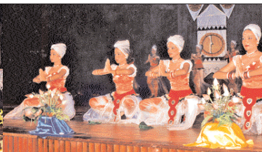
A traditional dance