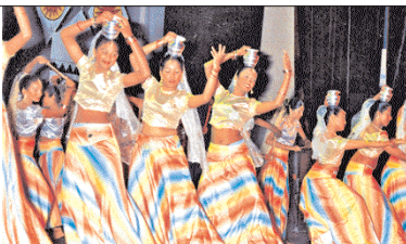
Dancing to the beat