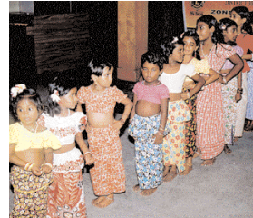
Little ones presenting a dance item.