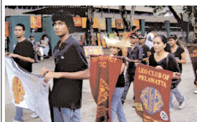
Leos at the Walk