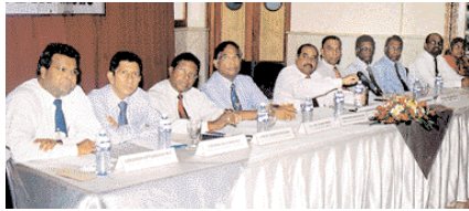
District Governors of 306 at the head table