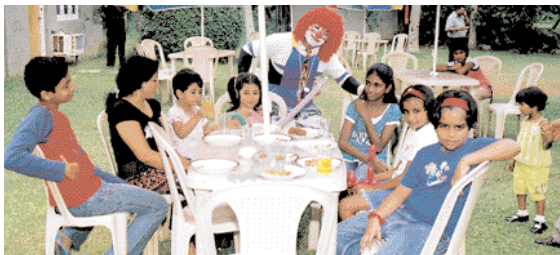
A clown entertains the little ones.