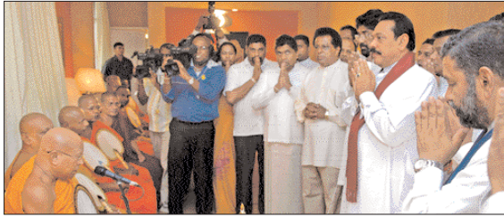
Maha Sangha invoke blessings on the President.

The return of President Mahinda Rajapaksa, when the Sri Lankan aircraft touched down at the Bandaranaike International Airport was charged with emotion as he was returning to a country liberated under his political leadership from the grasp of a terrorist group that was being held up as an invincible fighting machine. The moment he stepped on the soil he bent on his knees to salute the Motherland amidst the spontaneous applause and cheers from the large crowd gathered to welcome a leader who had created history by vanquishing a ruthless terrorist outfit. President Mahinda Rajapaksa was greeted warmly by the clergy of all three religions, Ministers and senior officials. The Maha Sangha blessed him with pirith chanting. Since independence no leader was received with such a rousing welcome as the country's freedom and territorial integrity was threatened as much as during the last 30 years. President Rajapaksa had achieved the impossible and demonstrated the world that terrorism could be wiped out if the correct leadership was given.