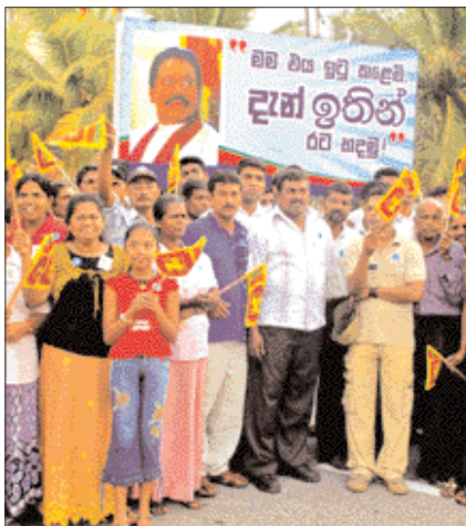
Large crowds await the President's arrival