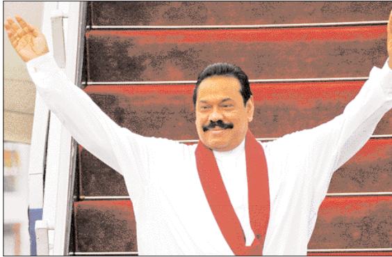
The President acknowledges cheers.