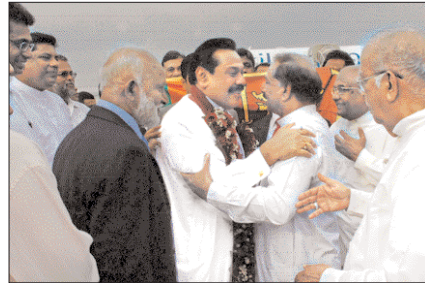
Meeting Minister Dinesh Gunawardena and other Ministers.