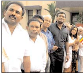
Artists waiting to greet the President