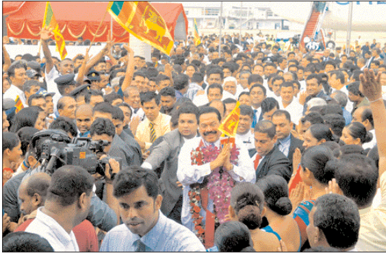
The President greets the public