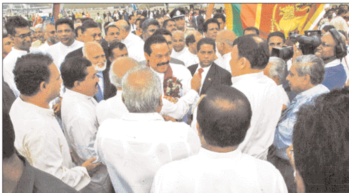
With senior Ministers