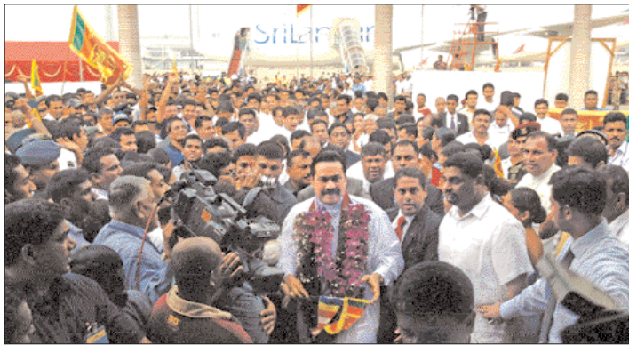
The President given a hero's welcome at the airport.