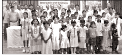
Children along with their parents, who received the funds from Rotary Club of Kandy Metropolitan.