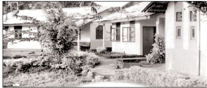
Front view of Camilla School