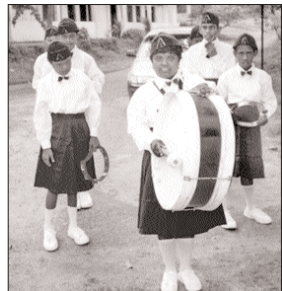
Camilla School band