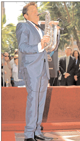
Jazz musician Dave Koz performs after being honoured by a star Hollywood. Dave performs after being honoured by a star on the Hollywood Walk of Fame in Hollywood, California.