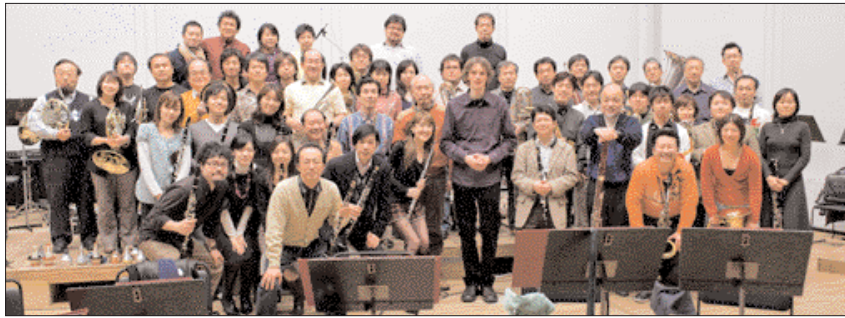
The Tokyo Kosei Wind Orchestra (TKWO)