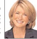
2004: Lifestyle guru Martha Stewart reported to prison to begin serving a sentence for lying about a stock sale.

2001: Former Pennsylvania Gov. Tom Ridge was sworn in as director of the new Office of Homeland Security.