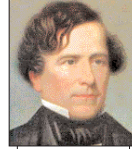
1869: Franklin Pierce, the 14th president of the United States, died in Concord, N.H., at age 64.