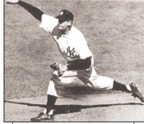
1956: Don Larsen pitched the only perfect game in a World Series as the New York Yankees beat the Brooklyn Dodgers 2-0 in Game 5.