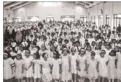
Students of K/Madina Central College (National School) primary section celebrated Universal Children's Day at the Ashroff Memorial Auditorium with teachers and the parents.