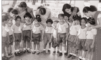
Giggles International pre-school, Matara celebrated International Children's Day recently with a series of special features conducted by the children. Here, the head mistress and teachers participate in an event.