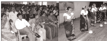
Pannala Elders Organizations Balamandalaya organised an elders variety entertainment under the patronage of Pannala Divisional Secretariat to mark World Elders' Day. Officials enjoy the entertainment (left). The kalagedi netuma performed by Makandura Elders organization (right).