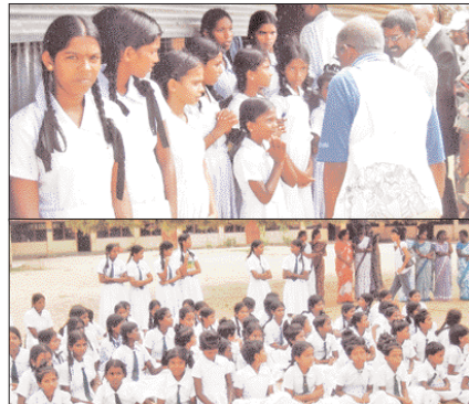
The children at the displaced centres with the Malaysian and Colombo West Rotarian at the Jaffna IDP Camps.

the children in Tamil languages and inquired from them about the facilities they received at the IDP camps. The children were very happy to say that the facilities at the camps are very good and happy to leave for their permanent residences.