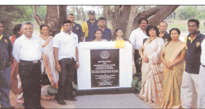
Panduwasnuwara, Colombo Central and Chester, England Rotarians at the handing over of the renovated tank.

Rotary Club of Panduwasnuwara jointly with Rotary Club of Colombo Central and Rotary Club of Chester-England renovated Munihirigama Tank, and handed it over to farmers and villagers at a ceremony held at Munihirigama.