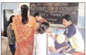
Doctors examining patients at the Medical Camp

There were 12 cataract patients who need to undergo urgent surgery. With the generous help from some of the Rotarians and Inner Wheelers, arrangements have been made to assist the cataract patients financially to undergo surgery.