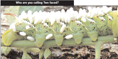
Who are you calling Two faced?

A lynx crosses the finish line during the first official training for the men's Olympic downhill skiing at Whistler Creekside Alpine skiing venue.