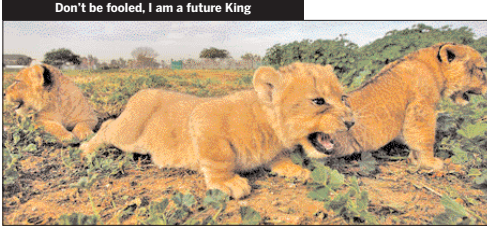
Don't be fooled, I am a future King

Called a tobacco hornworm, this rare creature appears to have numerous faces with what look like convincing 'eyes', complete with cheeky grins, peeping out all the way down its three-inch body. But, despite appearances, these are just markings. The worm only has one face, which is surprisingly glum compared to its body. Krista Queeney snapped these pictures at Gloucester, Massachusetts.