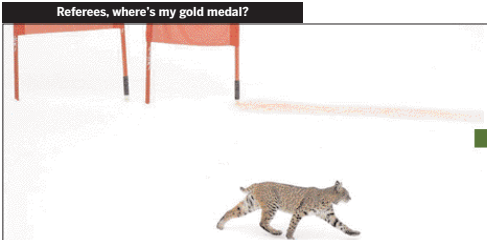
Referees, where's my gold medal?

A monkey does a handstand on the head of a sheep during a performance at a temple fair held to celebrate the Chinese New Year in Beijing.