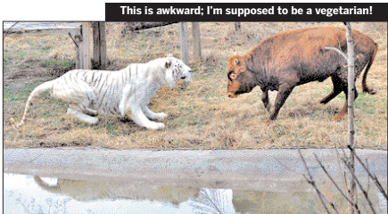
This is awkward; I'm supposed to be a vegetarian!

Two grey herons fight over a piece of fish passersby have fed them on a frozen lake in Berlin.