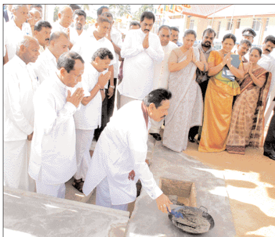
President Mahinda Rajapaksa laying the foundation for the new Town Hall complex at Hakmana.