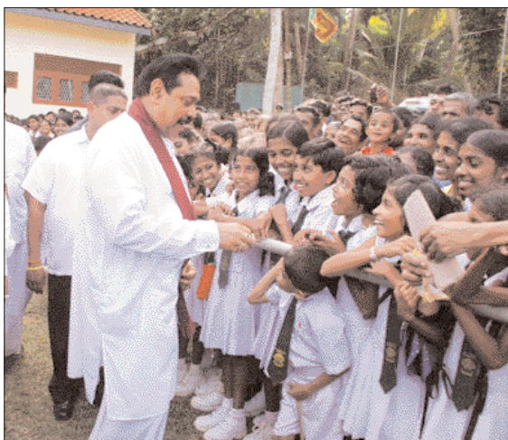
President Mahinda Rajapaksa talking to schoolchildren after opening a new school building at Kerawelapitiya, Hakmana.