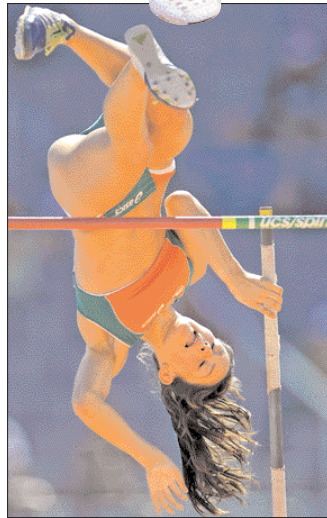
Ireland's Victoria Pena competes during the women's pole vault qualifications at the 2010 European Athletics Championships at the Olympic Stadium in Barcelona on July 28, 2010.