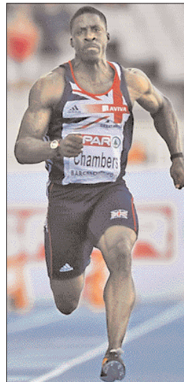
Great Britain's Dwain Chambers competes to win the first round of the men's 100m at the 2010 European Athletics Championships at the Olympic Stadium in Barcelona on July 27, 2010.