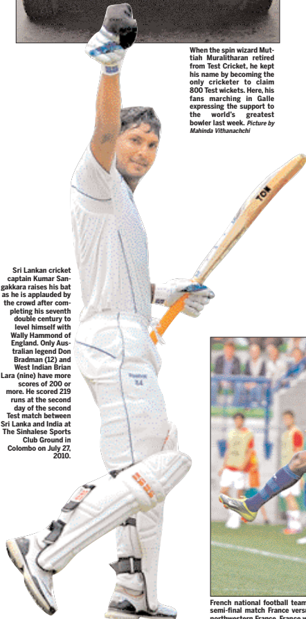
Sri Lanka cricket captain Kumar Sangakkara raises his bat as he is applauded by the crowd after completing his seventh double century to level himself with Wally Hammond of England. Only Australian legend Don Bradman (12) and West Indian Brian Lara (nine) have more scores of 200 or more. He scored 219 runs at the second day of the second Test match between Sri Lanka and India at The Sinhalese Sports Club Ground in Colombo on July 27, 2010.