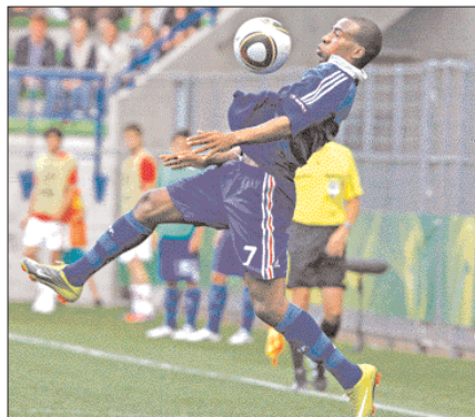
French national football team striker Gael Kakuta fights for the ball during UEFA under 19 semi-final match France versus Croatia, at the d'Ornano stadium on July 27, 2010 in Caen, northwestern France. France won 2-1.