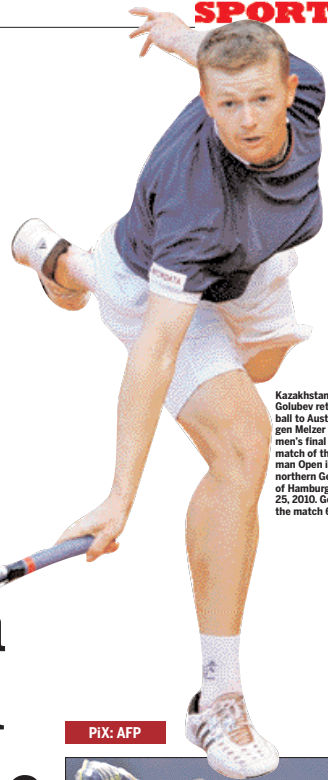
Kazakhstan's Andrey Golubev returns the ball to Austria's Jurgen Melzer during the men's final tennis match of the ATP German Open in the northern German city of Hamburg on July 25, 2010. Golubev won the match 6-3, 7-5.