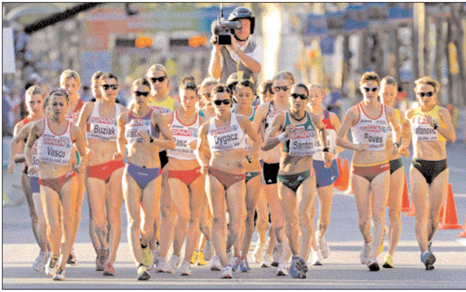
Athletes compete in the women's 20km walk at the 2010 European Athletics Championships at the Olympic Stadium in Barcelona on July 28, 2010.